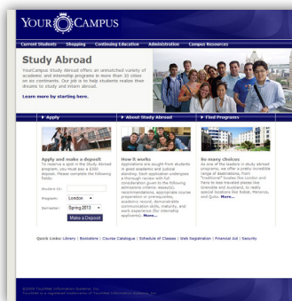
Your Business Application

Ability to initiate recurring payments that complement business needs.